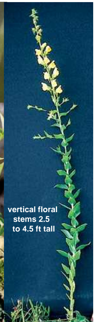
vertical floral stems 2.5 to 4.5 ft tall

Please look for Dalmation Toadflax in May and June before seed set.