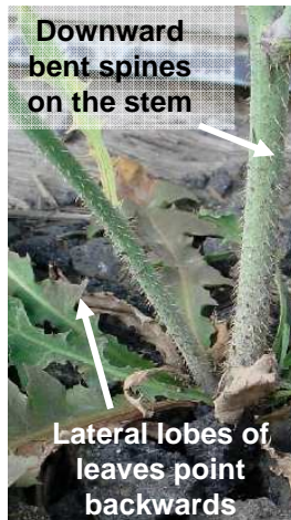
Downward bent spines on the stem